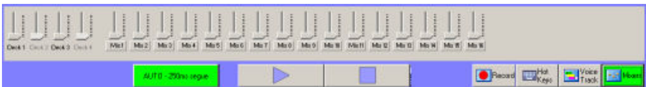
Figure 1: Simian's Mixer panel

To do this, you'll want to open the Mixer Panel by clicking on the Mixer button in the lower right-hand corner of the Simian interface (see Figure 1).